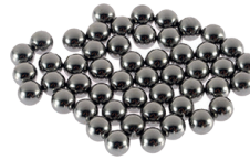
HR-A0760 & HR-A0761