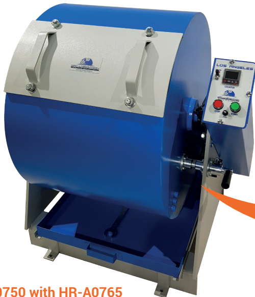
HR-A0750 with HR-A0765