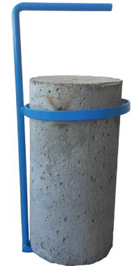
HR-C0249 with sample