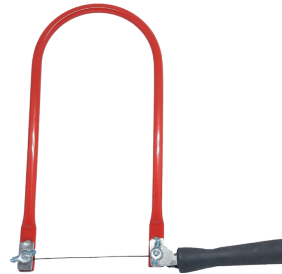
HR-G0753 WITH HR-G0754